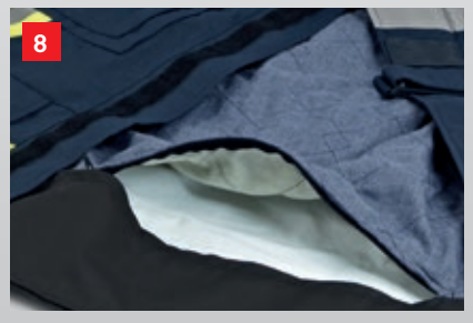
Inspection opening to check status of membranes