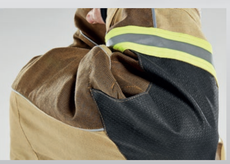
Its strengths: high tensile strength and flame resistance.

The new PBI material is especially characterized by extremely good mechanical properties. When it comes to tensile strength, the FIRE MAX 3 PBI NEO achieves eight times the performance required by standard EN 469 (> 3,600 N). In terms of tear propagation resistance, the suit exceeds the minimum requirements many times over (up to 600 N as per ISO 4674-1 procedure B).