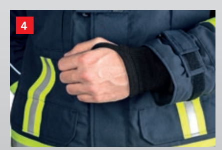
Sleeve width can be adjusted individually due to Velcro, sleeves with innovative NOMEX knitted wristlet and thumb hole