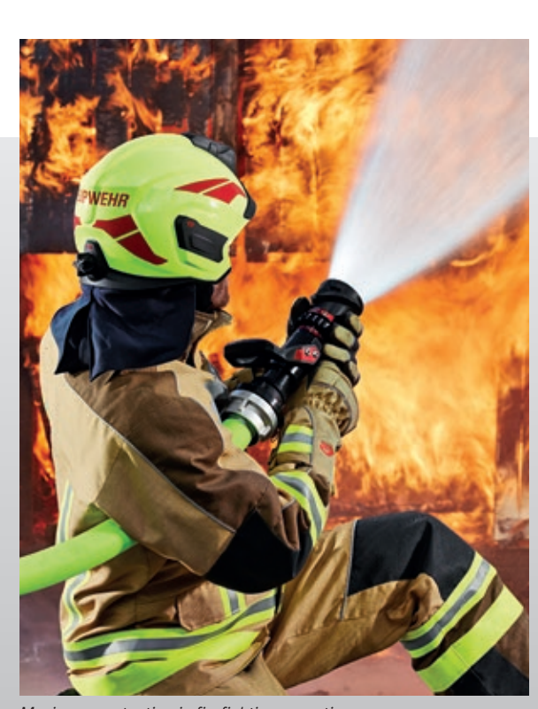
Maximum protection in firefighting operations.