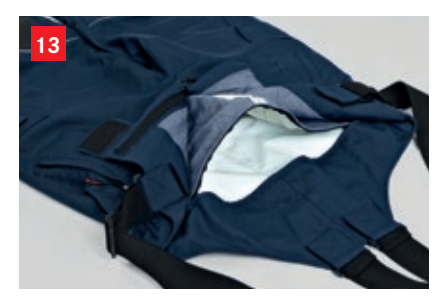
Inspection opening to check status of membranes