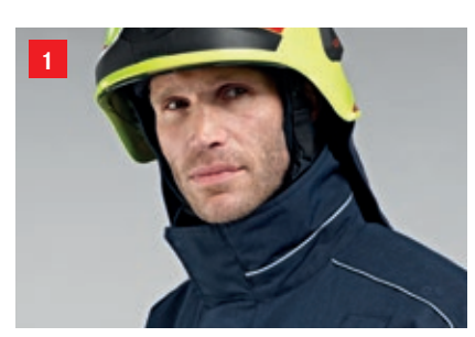
Flame protection collar can be pulled up under the helmet, closure with Velcro fastener at the front

FIRE MAX 3 was developed to meet fire departments' needs in the best possible way. The suit is equipped with numerous features and functional accessories to give firefighters maximum benefits in terms of safety, comfort, and practical handling.