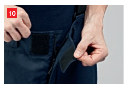
Fly with zipper and Velcro fastener, covered by flap