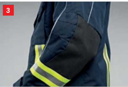
Ergonomically shaped elbows with reinforcements made of flame-retardant, silicon-carbon coated Para-aramid fabric