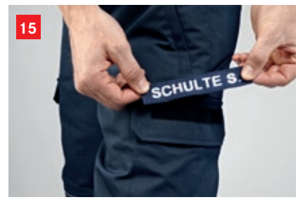
15 \times 2.5 cm fleece strip for attaching a name strip on the left side pocket flap