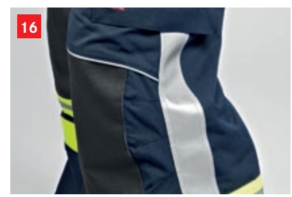
Ergonomically shaped knees with reinforcements and sewn-in knee pads made of water-repellent cellulose rubber.