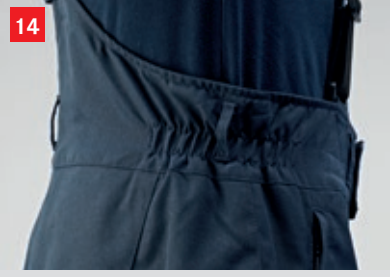
Elastic waistband for perfect adjustment