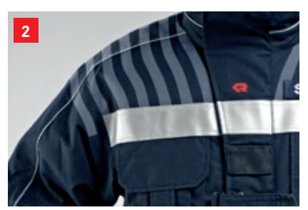
Heat protectors for even more safety in the breathing apparatus belt area