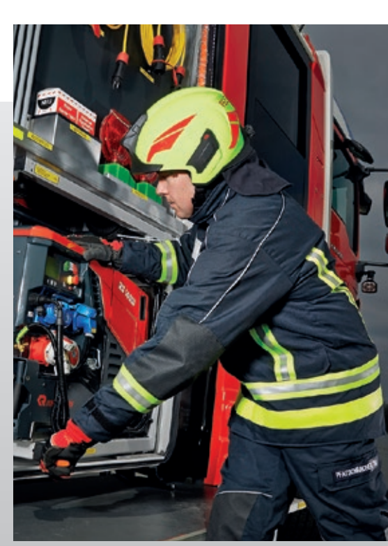
Highest level of comfort with every movement.