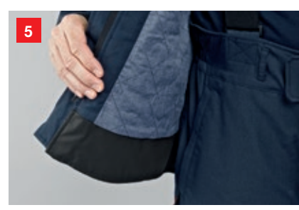
No moisture penetration thanks to moisture blocker made of PU-coated Aramid fabric