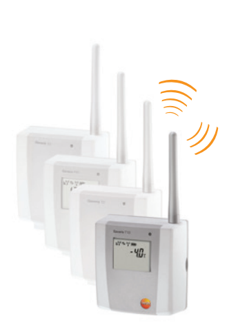
testo Saveris wireless probes

By connecting a testo Saveris Converter to an Ethernet socket, the signal from a wireless probe can be converted into an Ethernet signal. This combines the flexible installation of a wireless probe with the exploitation of the existing Ethernet even over long transmission distances.