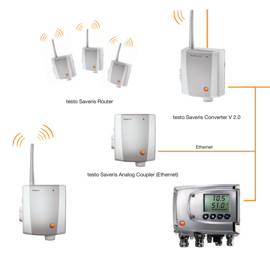
testo Saveris Analog Coupler (wireless)