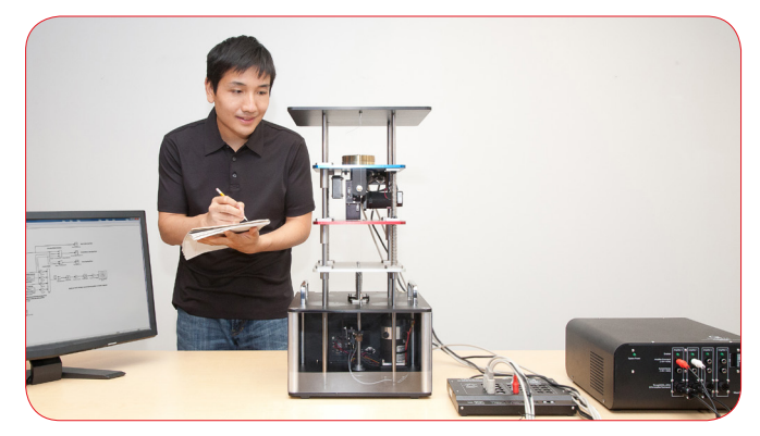
Active Suspension workstation

Laboratory Guide, User Manual, and Quick Start Guide (provided in digital format) Sample pre-built controllers and complete dynamic model