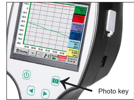
Photo key saves current screen as an image file. No additional software necessary.