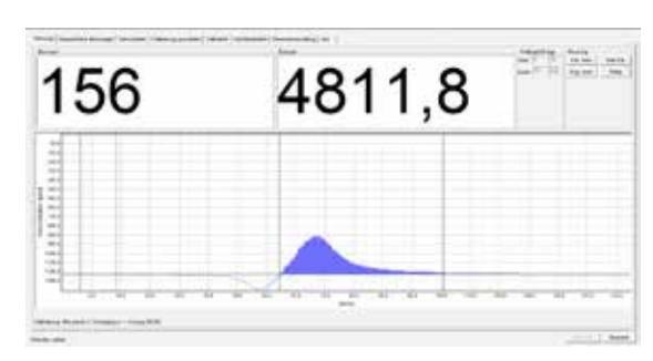
Fig. 3 View of a measuring curve.

The software is very easy to use by means of tabs. It includes an extensive selection of measuring ranges, as well as calibration and parameter settings, which permit a quick and accurate analysis of the sample. The measurement series, which can be exported for further processing, are automatically evaluated, internally stored and displayed in the form of data tables and measuring curves (1Fig. 3).