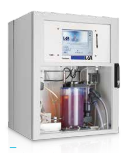
Highly sensitive bacteria in a robust analyser.

ToxAlarm continually checks drinking and surface water for pollutants. Additionally, the reaction of highly sensitive bacteria to potential toxins in water is determined. The measurements follow at intervals of less than 5 minutes.