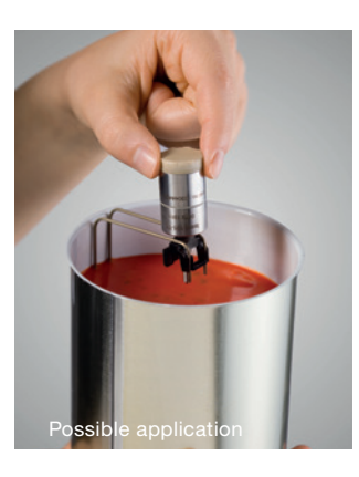
Temperature measurement in a can: testo 191-T1 + stand