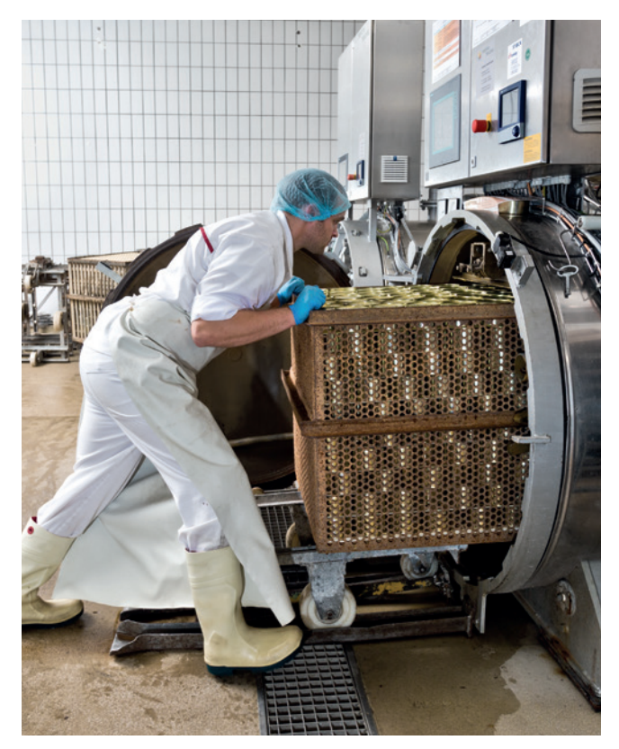
Autoclaving canned sausage.