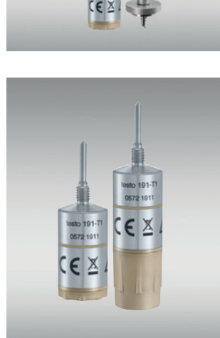
Depending on the application, you can vary the size of the logger through our flexible battery concept.