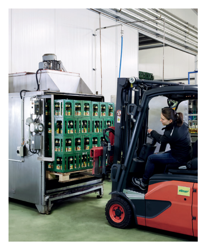
Pasteurizing fruit juice beverages.