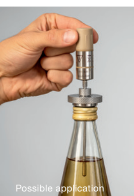
Temperature measurement in a can/bottle with the logger fitted externally: testo 191-T2 + can and bottle attachment

Temperature measurement directly in the food: testo 191-T1