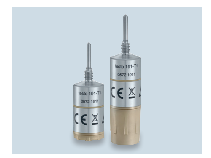
The testo 191-T1 data logger in both battery versions.

A world innovation of the system greatly facilitates the work of quality supervisors in the food industry: the data loggers' battery and the measuring technology are contained in two separate housings. The screw cap enables both battery types to be quickly and easily changed without any tools at all. And after the battery change, the loggers remain 100% tight.