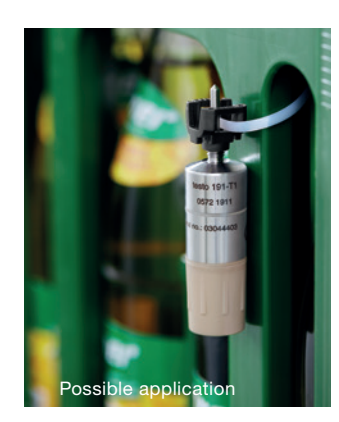
Measurement of ambient temperature: testo 191-T1 + retaining clamp and cable tie (cable tie not included in the scope of delivery)