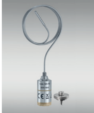
Temperature measurement in particularly deep cans/ bottles: testo 191-T3 + can and bottle attachment