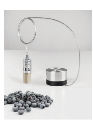
Temperature measurement in freeze-drying: testo 191-T3/-T4 + freezedrying probe holder