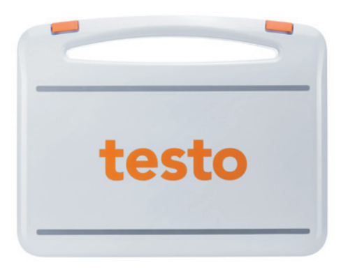
Multifunction case for up to eight data loggers.

The transport case with integrated programming and readout unit is also used to configure and read out up to eight data loggers in parallel. Configuration and readout are carried out by USB via the testo 191 professional software. An image of the case and the loggers contained in it is displayed here. All that remains to be done is to set the relevant parameters - now it's ready to use.