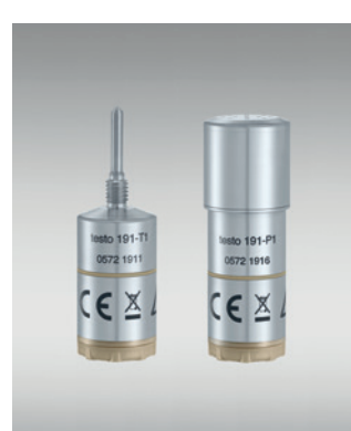
Temperature and pressure measurement for sterilization in autoclaves: testo 191-T1 + testo 191-P1