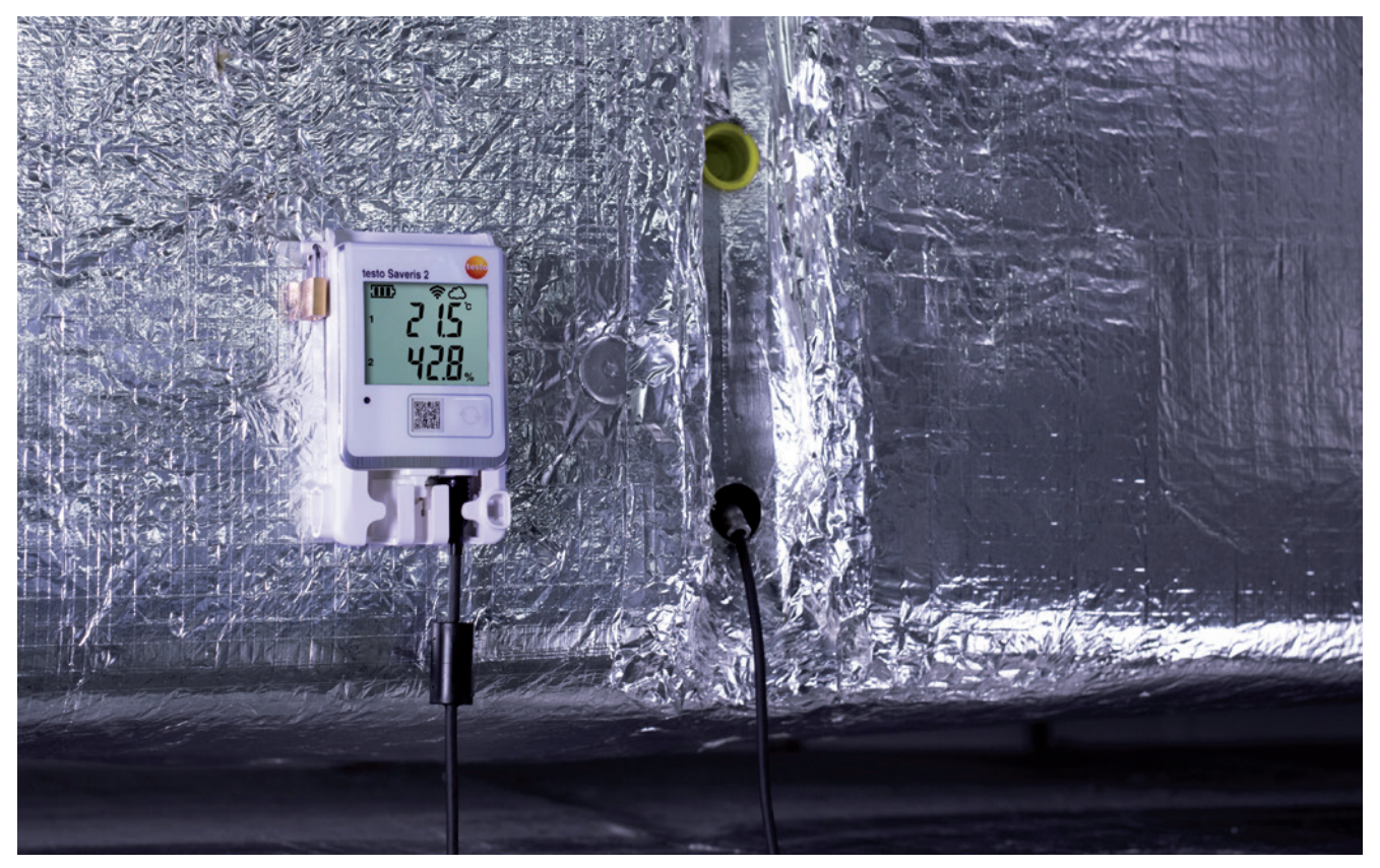
A testo Saveris 2 WiFi probe measures temperature and humidity in a ventilation duct.