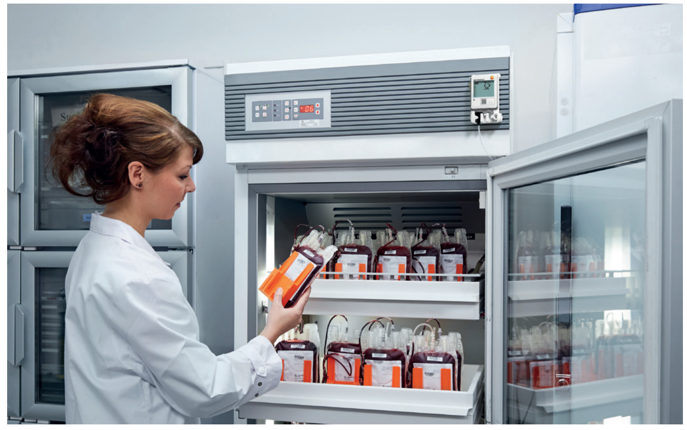
A WiFi data logger monitors the temperature in a blood refrigerator, and provides the staff with an alarm when critical deviations occur.

temperature increases in one of the switching cabinets, the system automatically sends an alarm by e-mail or SMS. For the purposes of preventive maintenance, it is possible to react before expensive damage to the systems or critical delays in the clinic's procedures occur. The alarm function can be easily transferred to staff members, so that they can react quickly on site. In addition to this, you can use the ambient data to determine which areas are not correctly air conditioned. This allows the efficiency of the the clinic to be increased, and at the same time, building damage, for example caused by mould growth due to insufficient ventilation, to be avoided. Thanks to the Quick Start Guide, the WiFi data logger system is quick to install, and can be extended by further data loggers at any time. Due to its simple and flexible handling, testo Saveris 2 allows facility managers to keep climate monitoring at different areas of responsibility under control - even when they are not on site.