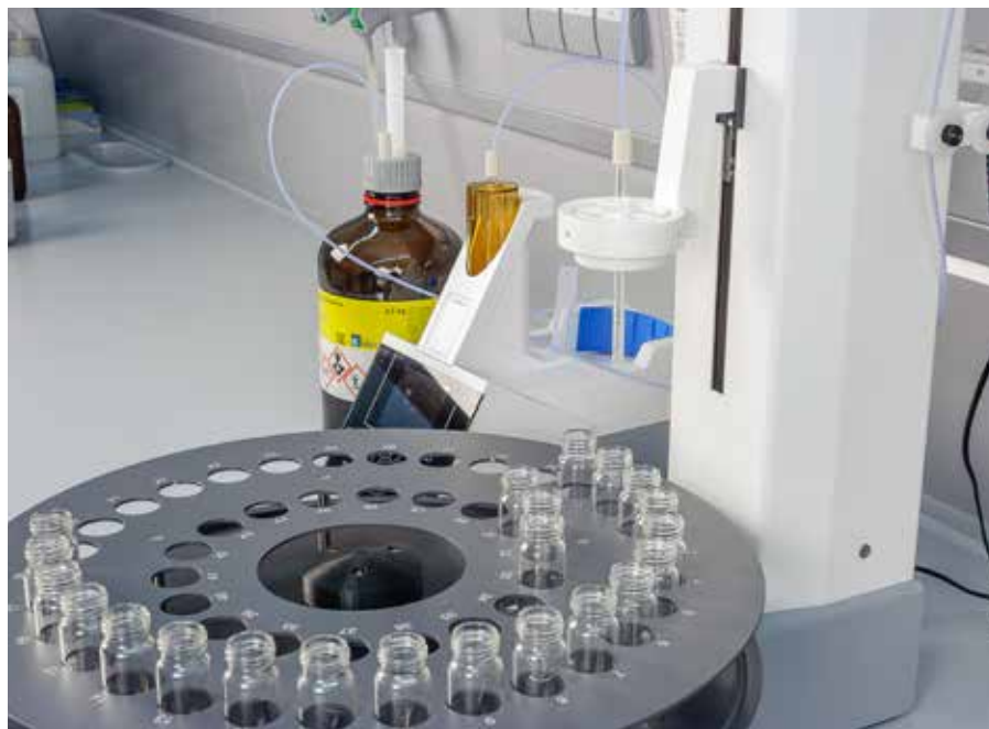
TZ4050 sample tray for VZ7088 laboratory bottles