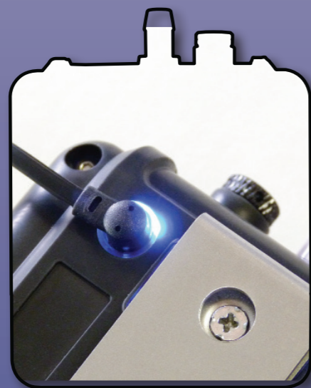
USB charging with magnetic connector and sure-connect LED indicator