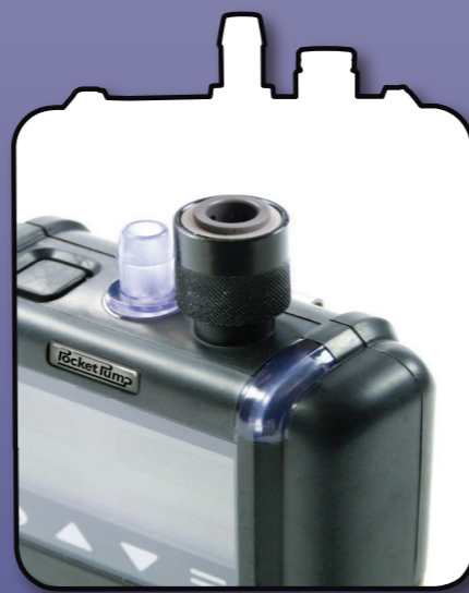
Optional quick-connect for secure bag sampling