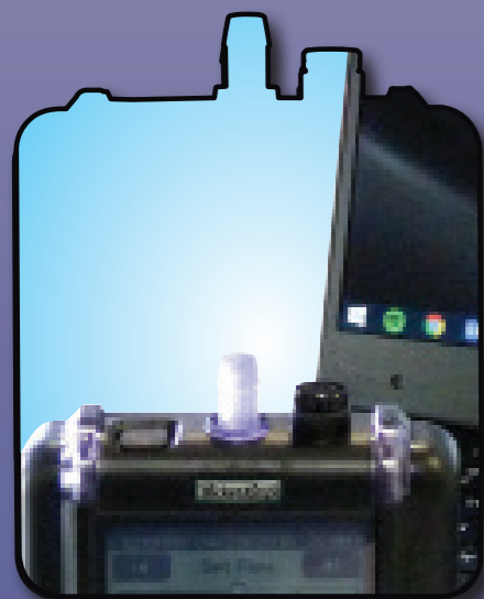
Bluetooth® communications with PC and DataTrac® Pro Software