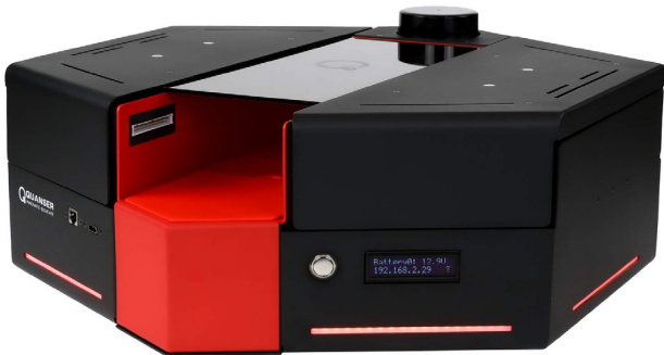
Product may not appear exactly as shown Product shown with QArm Mini (sold separately)